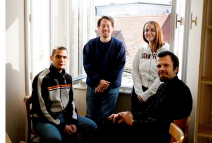
... and relaxing after a good day work