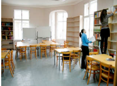
... sorting them...